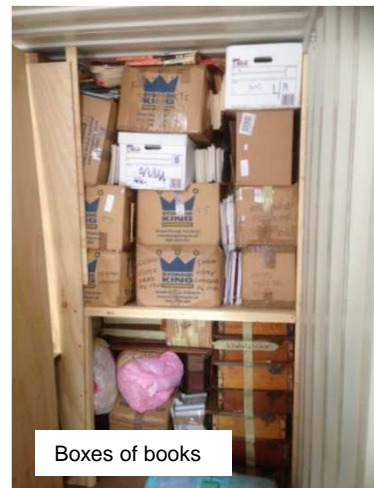
Boxes of books

As well as many thousands of school books the load includes school desks for three schools, swimming training pool equipment for use at New Hope orphanage, industrial and home sewing machines, industrial tools and equipment, computers, toys, art equipment, knitwear and blankets, bicycles, large cooking pots, Braille books and aids for the blind.